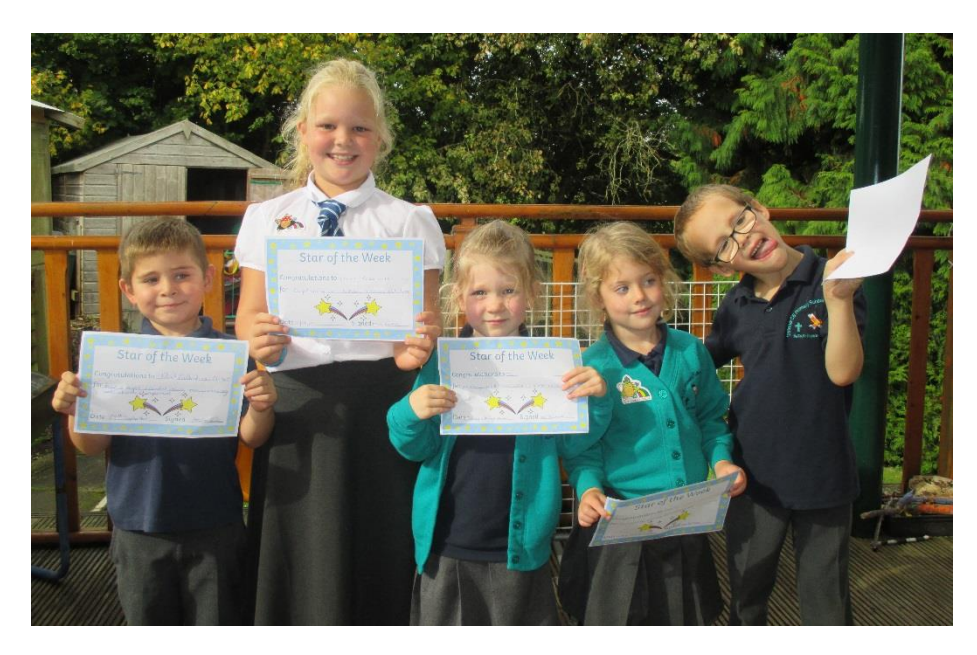
Diary Dates New or amended dates in BOLD